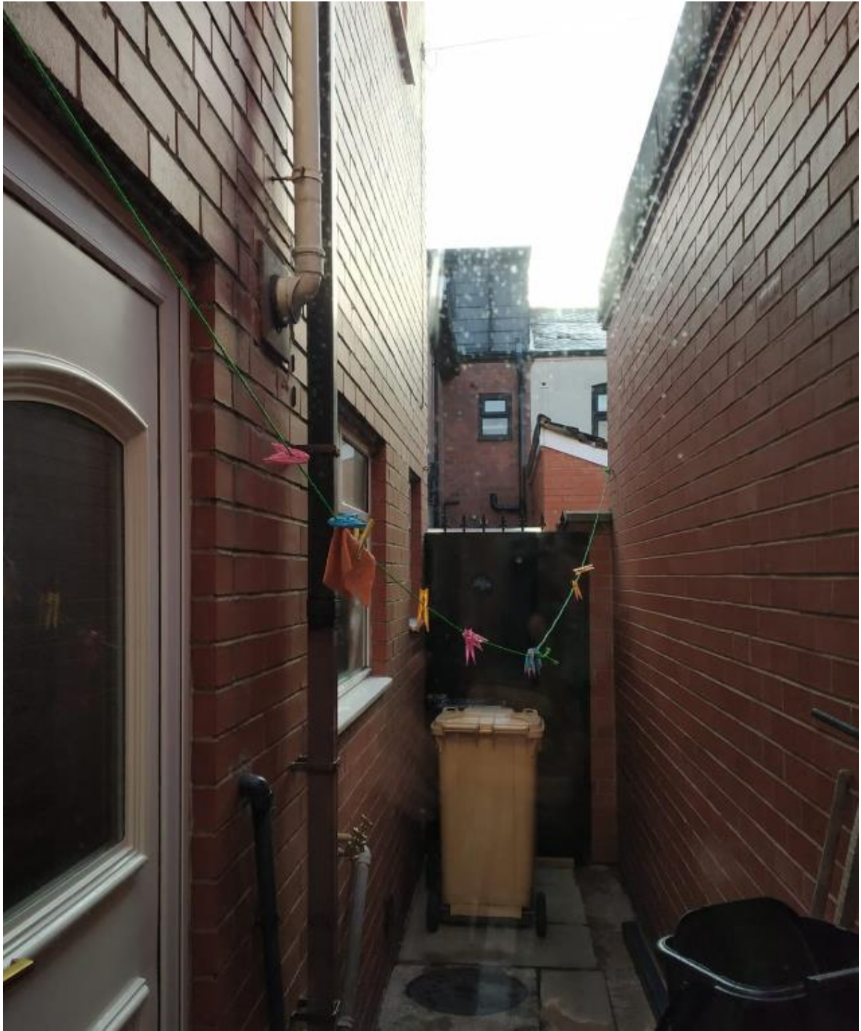
View of the rear yard of No. 42 Windermere Street