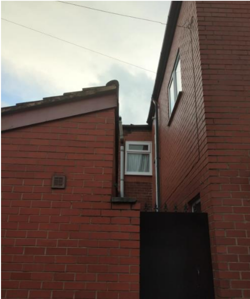
View from the back street with direct views of the windows within bedroom 2 and 3.

The neighbour at No. 42 has provided a number of photos in support of their objection to the proposed extension at No. 40 Windermere Street