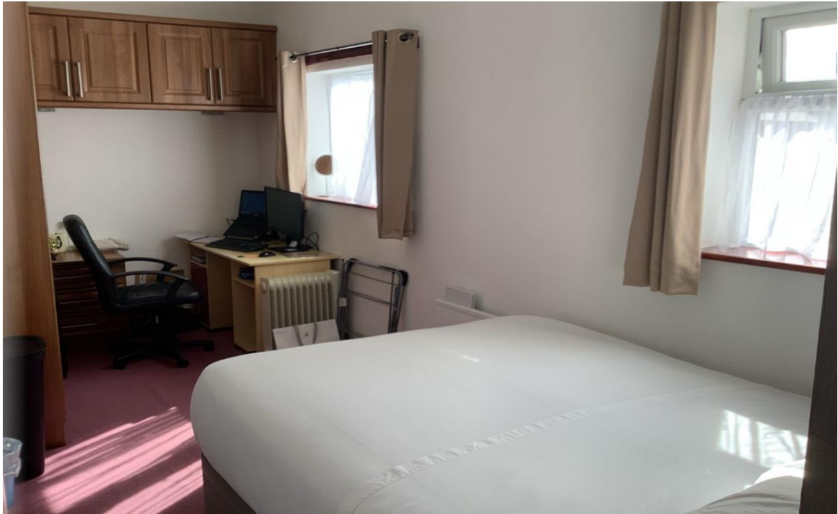
Internal of Bedroom No. 2 and office