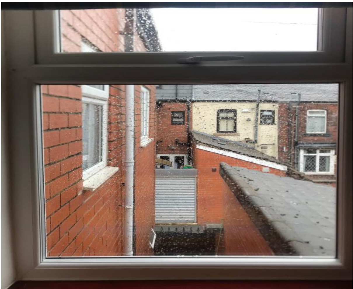
View from bedroom 3 window