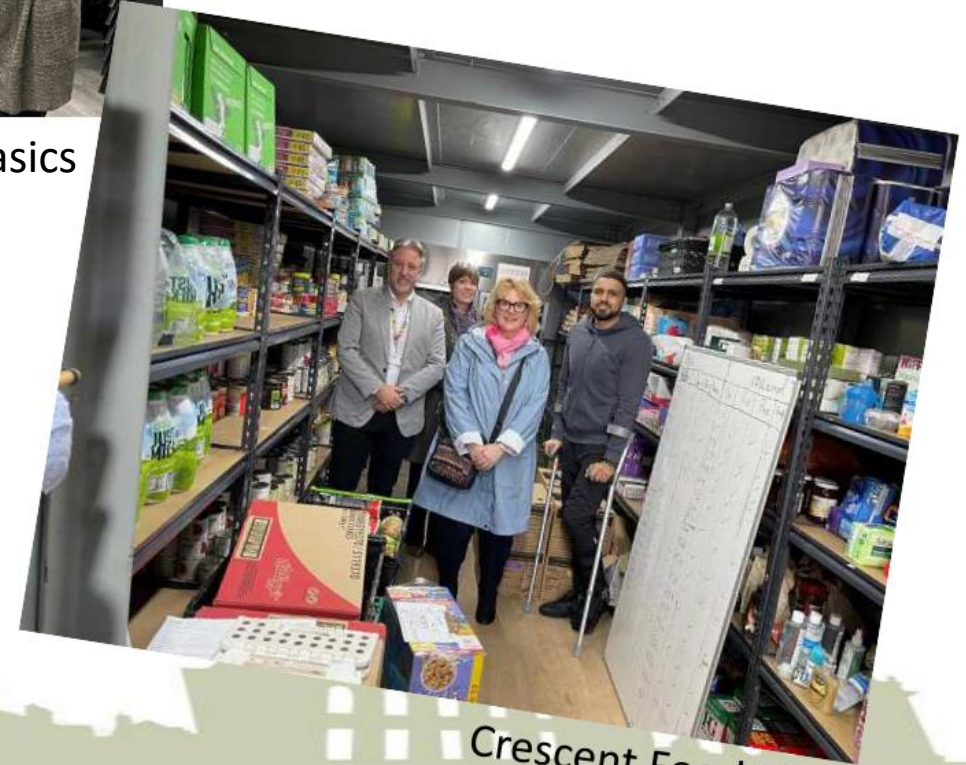
Crescent Food Bank

Bolton's Fund Round 33 Household Support Fund December 2022 14 Awards £200,000