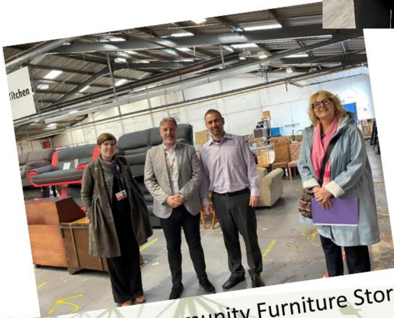
Bolton Community Furniture Store

Bolton's Fund Round 33 Household Support Fund December 2022 14 Awards £200,000