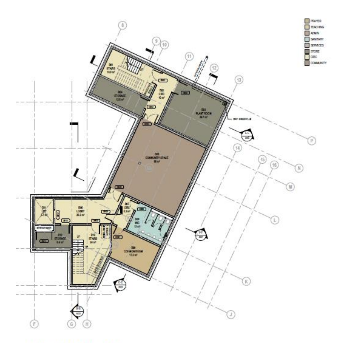
PROPOSED BASEMENT FLOOR PLAN