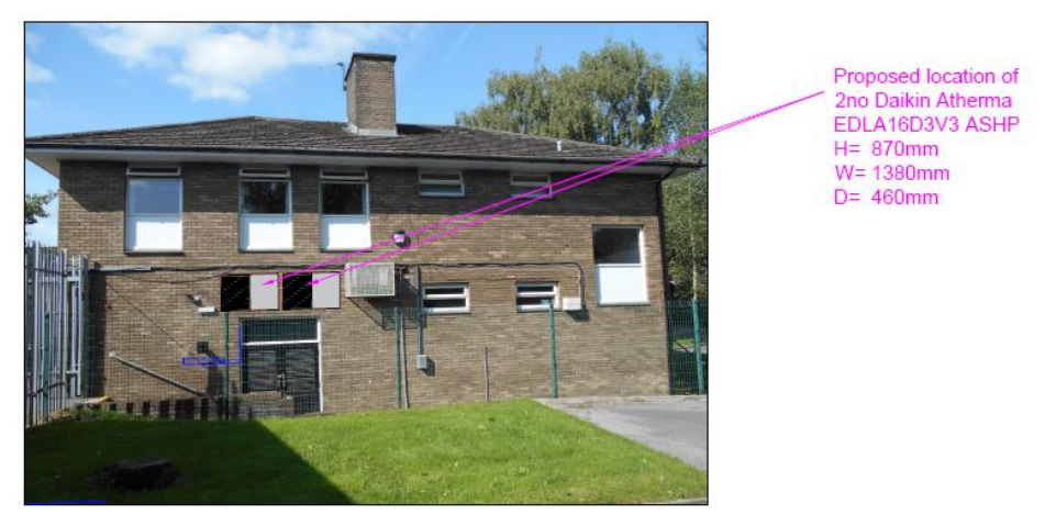
Condition 3 has subsequently been amended in line with the above plans.